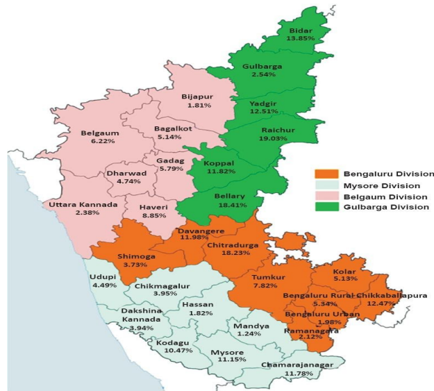
Karnataka's tribal population as percentage of total population in each of its 30 districts.