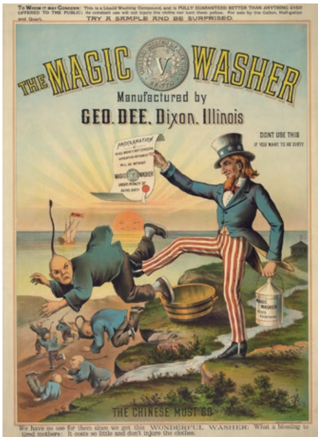
Laundry detergent the Magic Washer advertisement. Uncle Sam, with the proclamation and a can of Magic Washer manufactured by Geo. Dee, Dixon, Illinois, kicking a group of Chinese out of the United States. Shoher & Carqueville (c. 1886).

School to the Oriental Public School and ordered Japanese and Korean children to also attend (J. Kuo 1998). Starting with the Page Act of 1875, the Chinese Exclusion Act of 1882, the Gentleman's Agreement of 1907, the Cable Act of 1922, and the Oriental Exclusion Act of 1924 were implemented to ban immigration from all Asian countries and to prohibit their ability to acquire citizenship. These institutionalized discriminatory policies reduced Asian Americans to the status of "perpetual foreigners."