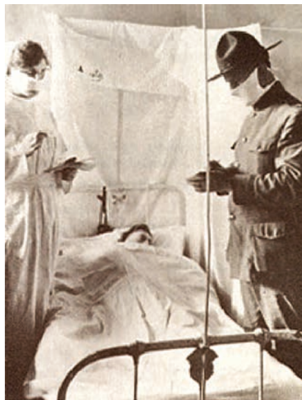
Scene from Camp Devens, 1918. In the second week of September 1918, influenza spread to Camp Devens outside of Boston, killing hundreds of men.

Many townspeople had read the newspaper accounts in early September reporting on a mounting crisis among sailors at Boston’s Commonwealth Pier, as well as in army camps where