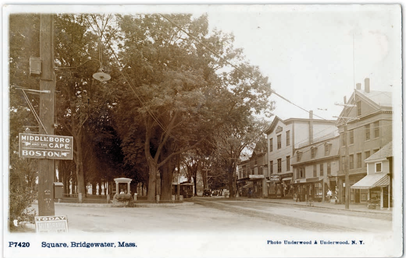
Postcard. Bridgewater Central Square, early 1920s.

volunteers from among the students,” said the newspaper, “work has been kept along but it has been and still is a trying time for those in authority.”