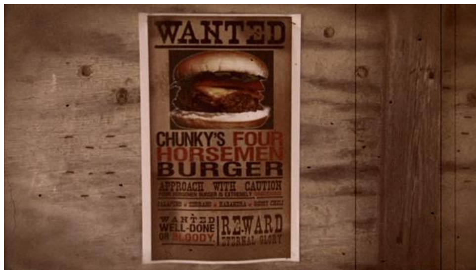
Figure 1: “The Four Horsemen Burger” ( Man V. Food , 2010a)

A recurring theme in Man V. Food 's portrayals of masculinity is toughness. Richman is seen to perform one variant or another of 'tough'/hegemonic masculinity in many episodes, which are often identified with stereotypes associated with the location he is visiting. In Las Vegas he impersonates a NASCAR racer; in Philadelphia a boxer; and in Michigan a baseball player ( ManV.Food , 2010b,h,i). There is a sense of irony around Richman's excessively performative depictions of masculinity. However, irony is mostly overridden by underlying pressures to incorporate the commonalities of the racer, boxer and athlete into accepted and acceptable embodiments of masculinity. The following scene analysis shows Richman in Texas, imitating a Ranger/cowboy.