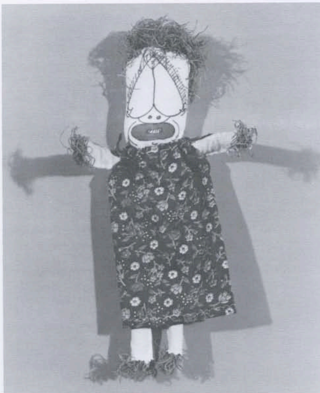
Artist unknown Voodoo Doll Fabric and fiber 11"h x 5½"w

The much maligned island of Haiti, in the Carribean, is a black republic peopled by gentle peasants who are among the poorest in the world. Although poor, Haiti is rich in culture, particularly in the expressions the people give to their religious beliefs. God and their Voodoo spirits (Loas) are an integral part of their daily lives.