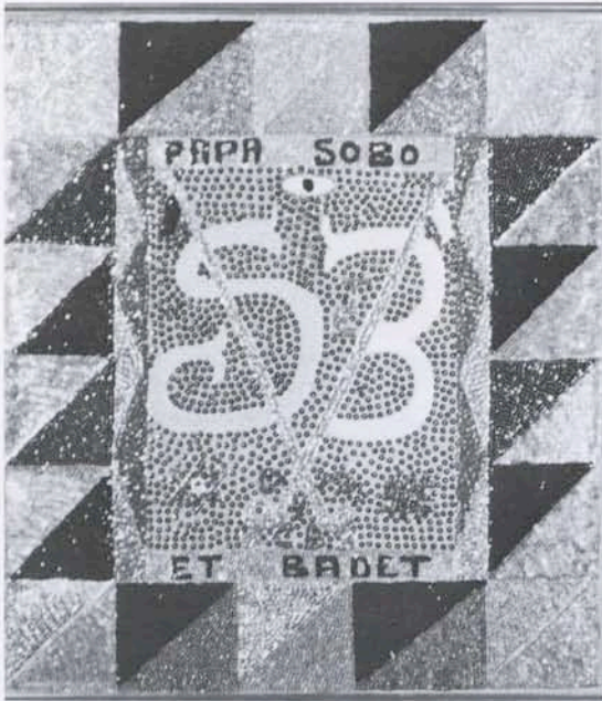
Papa Sobo Flag Fabric and sequins 36½"h x 32"w