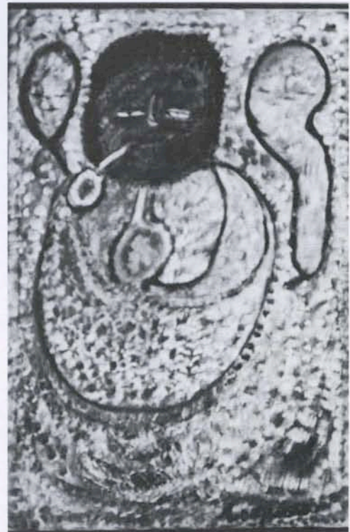
Robert St. Brice Untitled Oil on canvas 30"h x 20"w