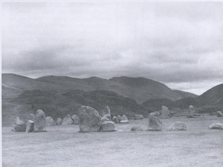
Castlerigg Stone Circle Keswick Cumbria, England

I do not think of the camera as "capturing" the land, the tree, the rock. I think of it as rather "liberating" my experience for other people. I have taken many photographs that give me great pleasure, but my favorites are those which make people want to go out and see for themselves what I have seen.