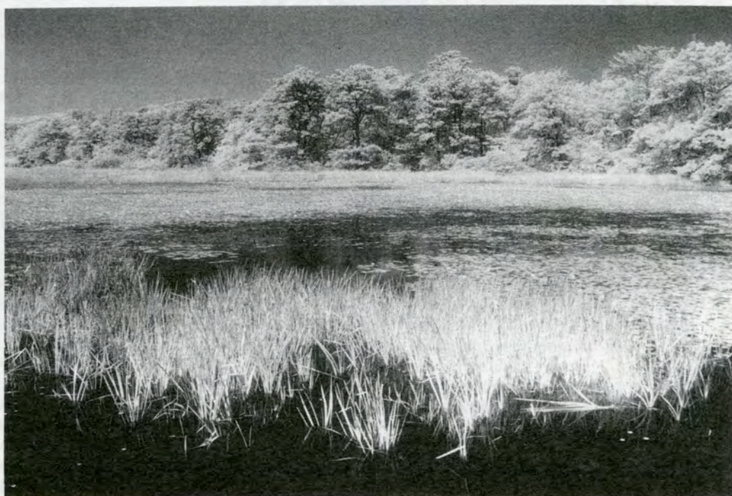
Pilgrim Pond. Province Lands Area. Cape Cod National Seashore. Provincetown, Massachusetts.