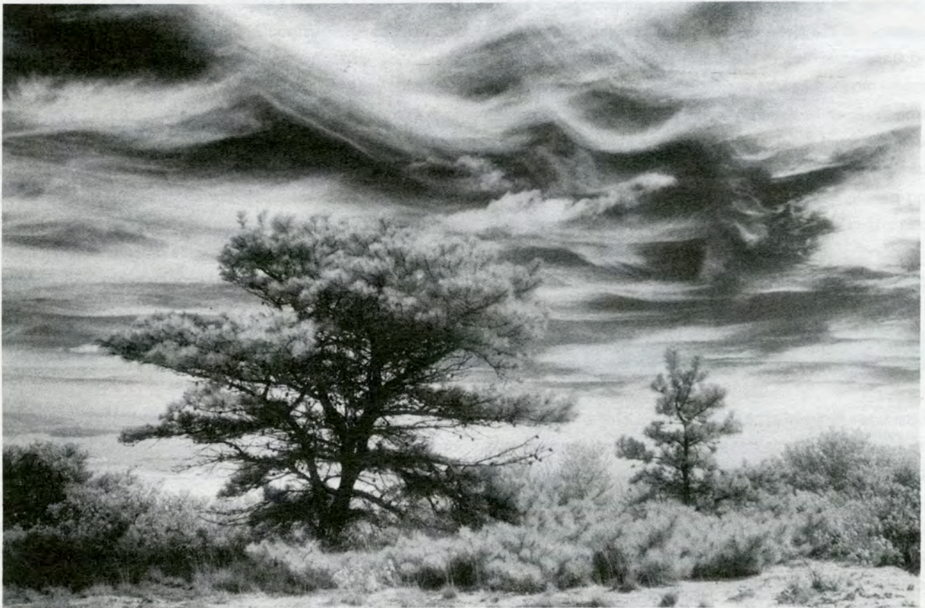
Dynamic Sky with Trees. North Truro, Massachusetts.