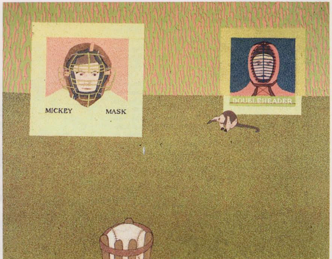
CULTURAL DOUBLEHEADER 1991 14" x 18" acrylic on canvas