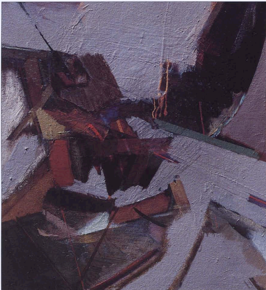
Baker's Beach , 1995. Acrylic on canvas. 25" x 27" William Kendall