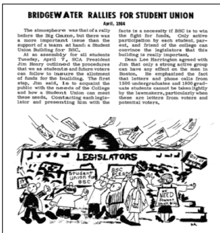
Fig. 6. The Campus Comment , December 14, 1964.

Signing legislation to ban racial imbalances in education, reorganize the state's Board of Education, liberalize birth control laws, and increase public housing for low-income families, his fight for equality and localized issues was not uncommon. Upon hearing of a student movement for a local cause, the students were called for a meeting with Governor Volpe to discuss the issue. Prior to this meeting, the undergraduate student paper, The Campus Comment , published a political cartoon to showcase the potential impact of this meeting. As showcased in Figure 7 the meeting of the undergraduate students and the morale of the students' spirit will influence the results of the formation of the Student Union Building. Following the meeting, Governor Volpe, in collaboration with Bridgewater State College administration and faculty, ensured the allocation of state funding for the construction of a student union building. After years-long protests, the undergraduate students at Bridgewater State College had reached their goal. Through determination, political activism, and patience, the construction of the student union building