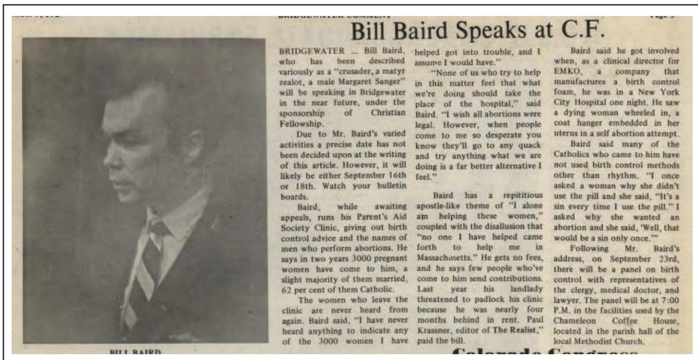
Fig. 4. The Comment , September 9, 1969.

arrested eight times during the 1960s for conducting lectures about birth control and abortion. One such arrest occurred following a lecture he conducted on April 6, 1967, at Boston University. In the state of Massachusetts at the time, it was prohibited to provide contraception to an unmarried person.