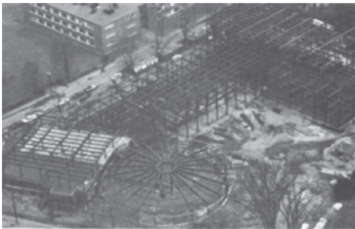
Fig. 8. “G roundbreak and Construction,” The Campus Comment , February 26, 1969.

formed to provide youth blacks a voice in the movement for equality. The students then organized various peaceful movements to address the inequality, such as sit-ins and peace marches. Ella Baker, a notable local African American civil rights activist, assisted the students in the formation of SNCC. Ella Baker in 1969, in regards to the civil rights movement by students, stated “Oppressed people, whatever their level of formal education, have the ability to understand and interpret the