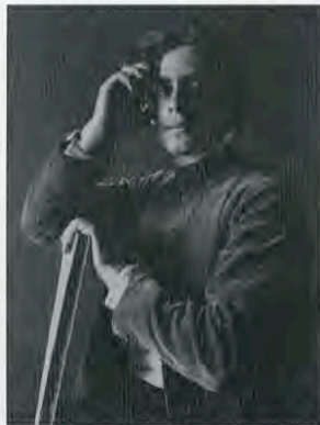
"Kahlil Gibran with Book," 1897, F. Holland Day, The Royal Photographic Society, Bath, UK

A major retrospective of Day's photographic oeuvre ended its run at the Museum of Fine Arts, Boston in March and this summer travels to museums in Amsterdam and Munich. It is a welcome re-examination of one of the world's master photographers in the Pictorialist tradition. Day's subject matter ranged from sensitive portraits and figure studies to allegorical depictions of classic subjects. Perhaps his best known works were his 'sacred' studies, including a bold series on the crucifixion of Christ for which he was his own model. All were well represented in the exhibition Art and the Camera: The Photographs of F. Holland Day . The exhibition also introduced to the public some of Day's philanthropic activity, a dimension of his career that deserves elaboration as it shaped both his life and his art.