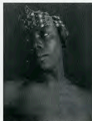
"Ethiopian Head Crowned," circa. 1897, F. Holland Day, The Royal Photographic Society, Bath, UK

Following a 1904 studio fire that destroyed his negatives, art collections,