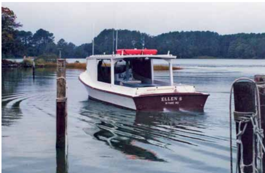
The Ellen S, the only remaining boat owned by the author's father. This year is the vessel's 33rd year in operation.

My father failed the stress test. While we were putting Christmas flowers on my dead cousin's grave, I cried over my father's health. He reassured me, telling me maybe it was time for this to happen. I spent the next week mourning the death of his fishing license and the blow to his masculinity. The intense guilt that has plagued me for such a long time led me to believe that I somehow caused this failure. My presence in the room while he was on the treadmill must have created the stress that undermined his health and ended his ability to maintain the only way of life he's