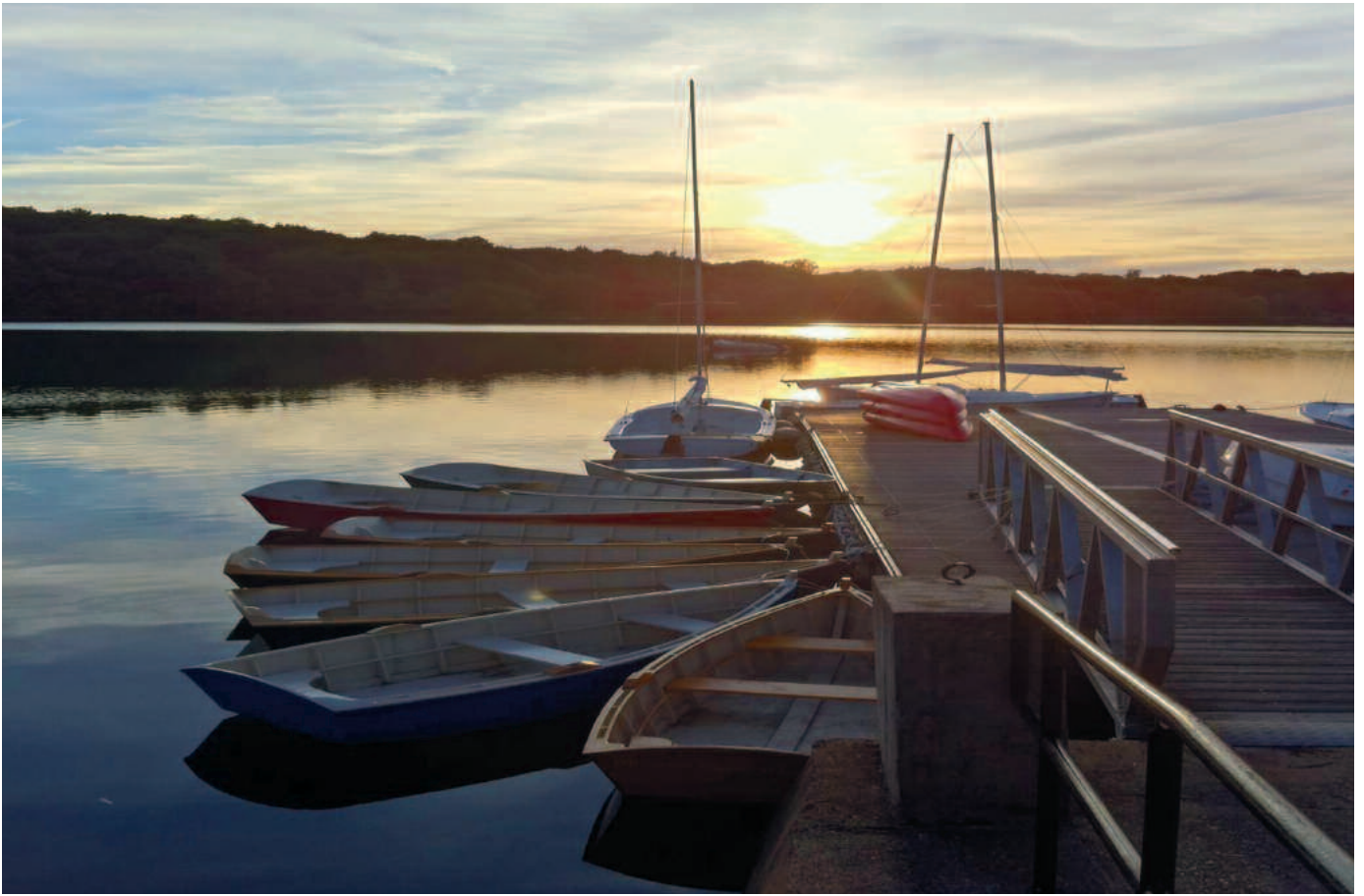
Jamaica Pond at dusk, July 2011 (Photo by author).