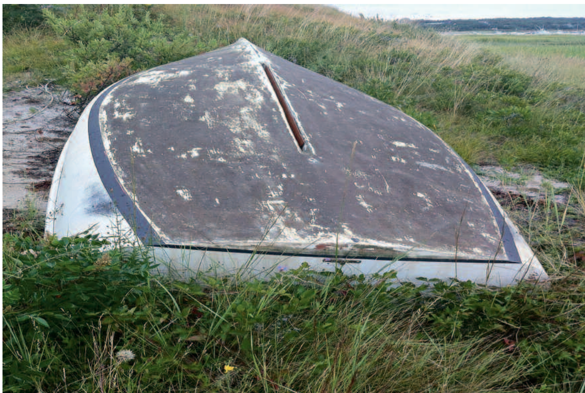
Cape Cod. Truro, August 2011.

In truth, I know so little about my mother. She was an intensely private person and anything I do know about her I know from stories other people, mostly her sisters, have told me. So, not to put too fine a point on it, I learned a great deal about my mother by watching this television show. Or I made up a great deal about her. But either way, it’s what I’ve got to work with. I would have liked to have checked my facts with her.