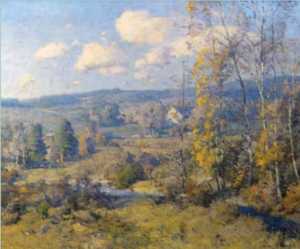
WILLIAM J. KAULA, Hills of New Ipswich , early 20th century. Oil on canvas.

ment of arrested action, is reminiscent of Vermeer, whose work had begun to be collected by Americans at the start of the twentieth century. In this instance, the girl is one of Kroll's neighbors, whom he painted on more than one occasion.