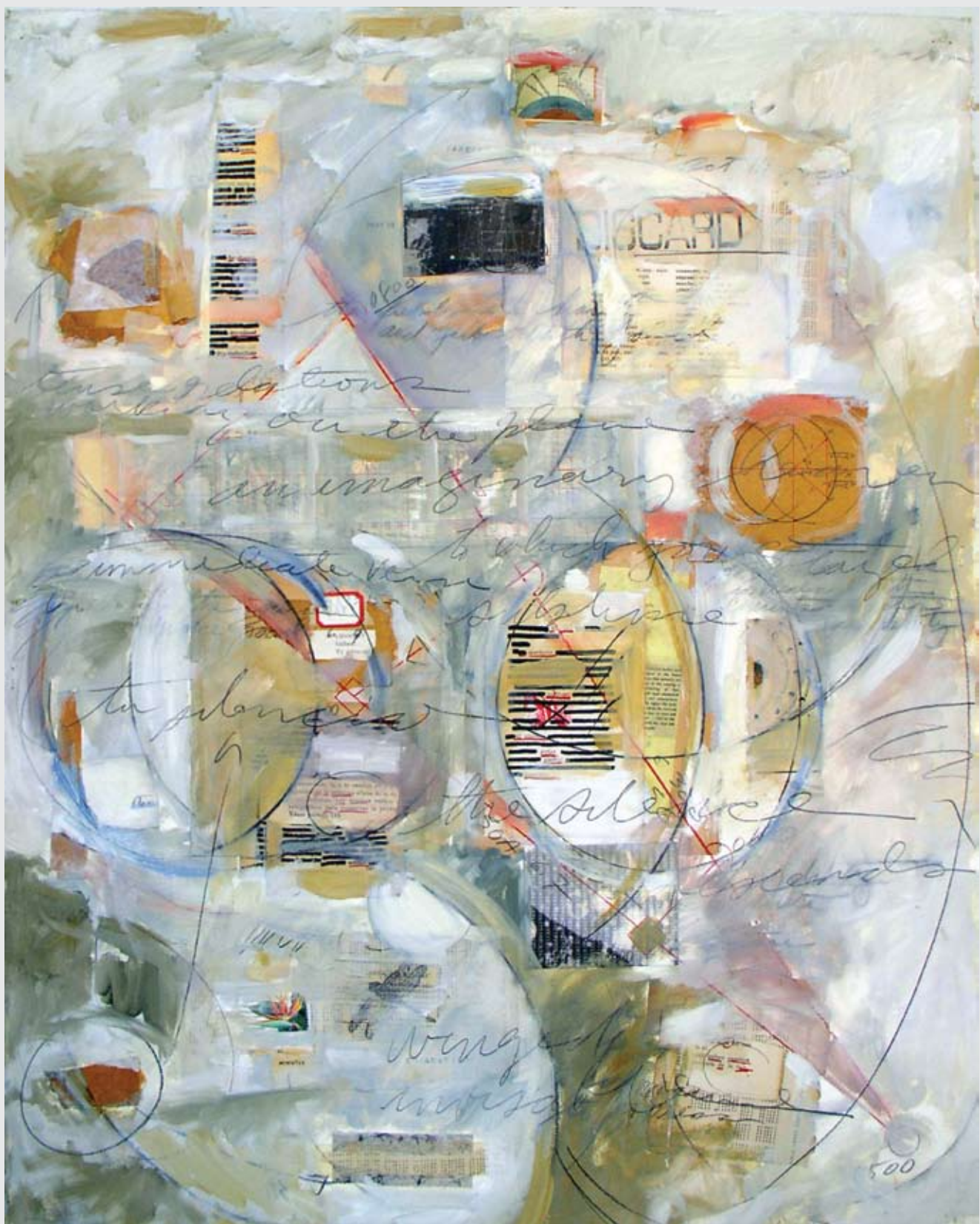
RANDOM PREOCCUPATIONS, No. 1 , 2008, collage, oil on Arches paper.