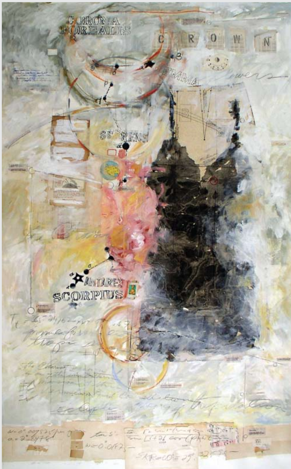
SOME UNKNOWN VENUS , Vermillion Bird Suite, 2008, collage, oil on Arches paper.