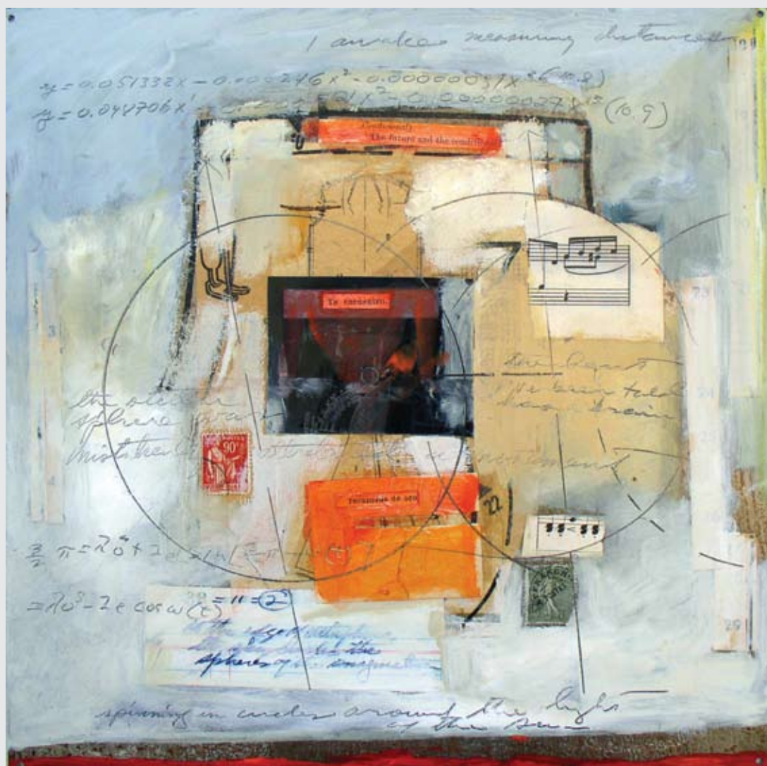
BELLE FOURCHE, Sixieme , Vermillion Bird Suite, 2008, collage, oil on steel.

The work featured here are selections from three separate suites: RANDOM PREOCCUPATIONS, 2007–present, DRAGONFLY SUITE, 2007–2008 and THE VERMILION BIRD SUITE, 2008–present. These visual suites integrate art and writing and explore an inner landscape that appears irrational and random. However, the suites are similar to how a musical composition comes together in a number of movements. Each suite focuses on the complexity of making decisions and the myriad forces that diverge and converge in order to do so. Beginning with the RANDOM PREOCCUPATIONS Suite, the original prose and art was used to emphasize the internalized thoughts and feelings and to describe the layered complexities visually—and sometimes in random, disconnected ways. The emergence of my creative writing is an essential component to the visual and conceptual purpose of the work. The structural language of the Symbolist poets and the richness