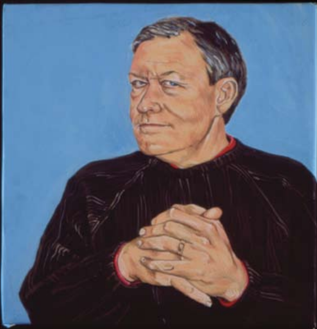
Below UNTITLED Pastel on Paper. 6" x 6"