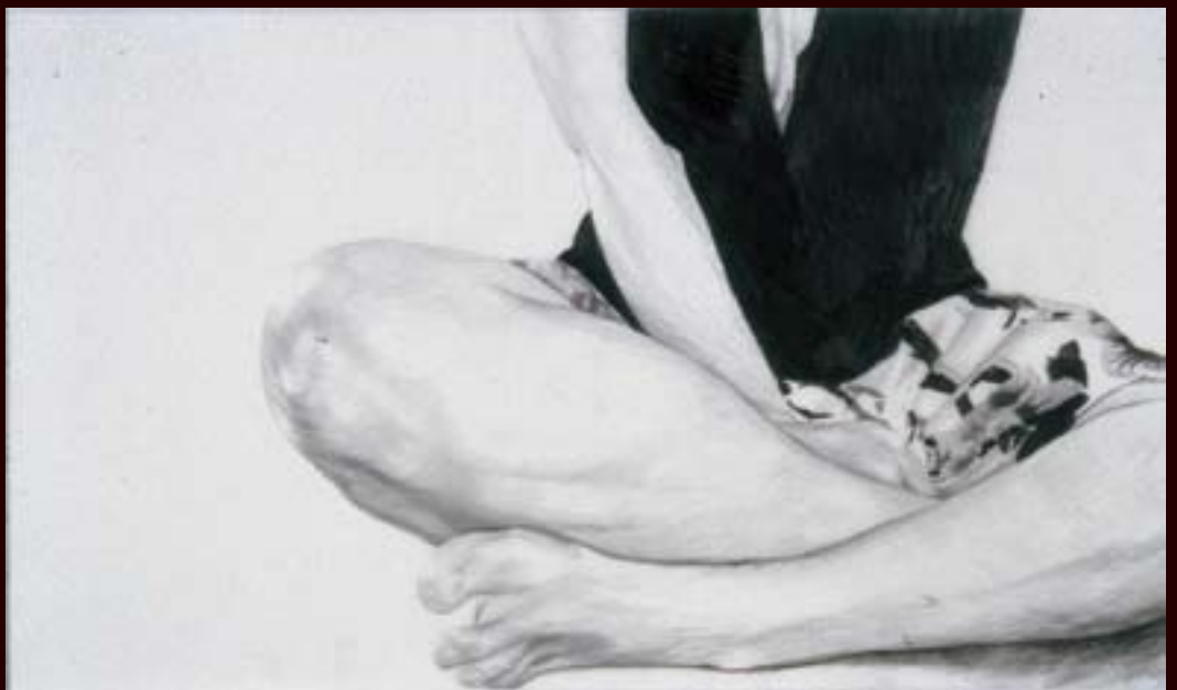
WHAT IS YOUR FANTASY? (series). Graphite on mylar. 7" x 12"

Our relationships are complex. What we project to the outside world may not be the reality of our inside world. But each of us exposes clues about our life and our relationships with the look of an eye, the expression of our mouth, our body language. We each expose ourselves in ways we may not have realized. And simultaneously, we clothe ourselves in deceptive guises as means of protection. Portraiture opens the door to the sitter's personal space. It provides insight to the subjects' character, their identity. ♦ Much of the work in my portfolio focuses on my (subjective) reactions to individuals, often family and close friends. Portraiture allows me to investigate both the physical and psychological attributes of these people and myself. I play with representation and narrative in attempt to create an image that is ambiguous in read; whose distance from reality, or fantasy, is indiscernible. And while my work is derived from personal experiences, I hope that it carries with it universal associations. ♦ One such subject into which I have recently made explorations is the morality issue. Historically represented as the 'Deadly Sins', these themes possess a universality that will allow those who view the work to relate intimately with it; each person having a unique encounter based on their own private experiences.