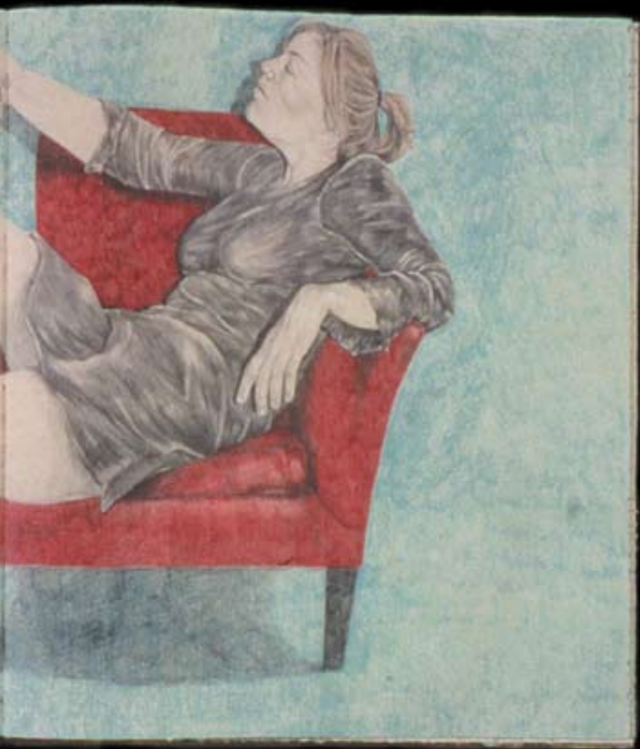
Pride (page of book). Colored pencil, graphite and pastel on paper. 22" x 44"