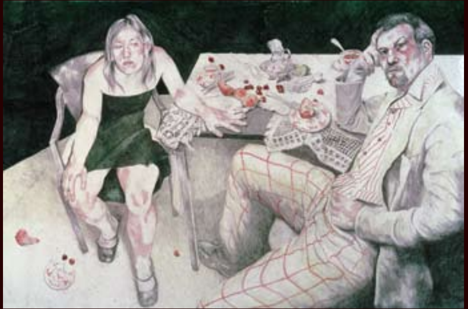
Right AFTERNOON TEA Graphite, watercolor and colored pencil on paper. 33" x 48"