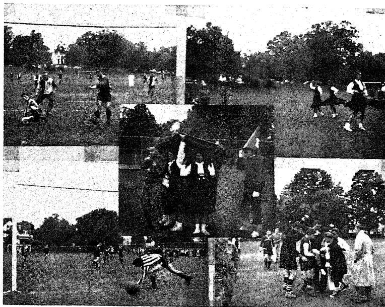
Here is an example of the action your team produces. The above pictures were taken at the New England-Bridgewater game at Bridgewater. The team has spirit but school spirit is lacking. Come on out and help support your undefeated team. It should be a pleasure, not a duty!