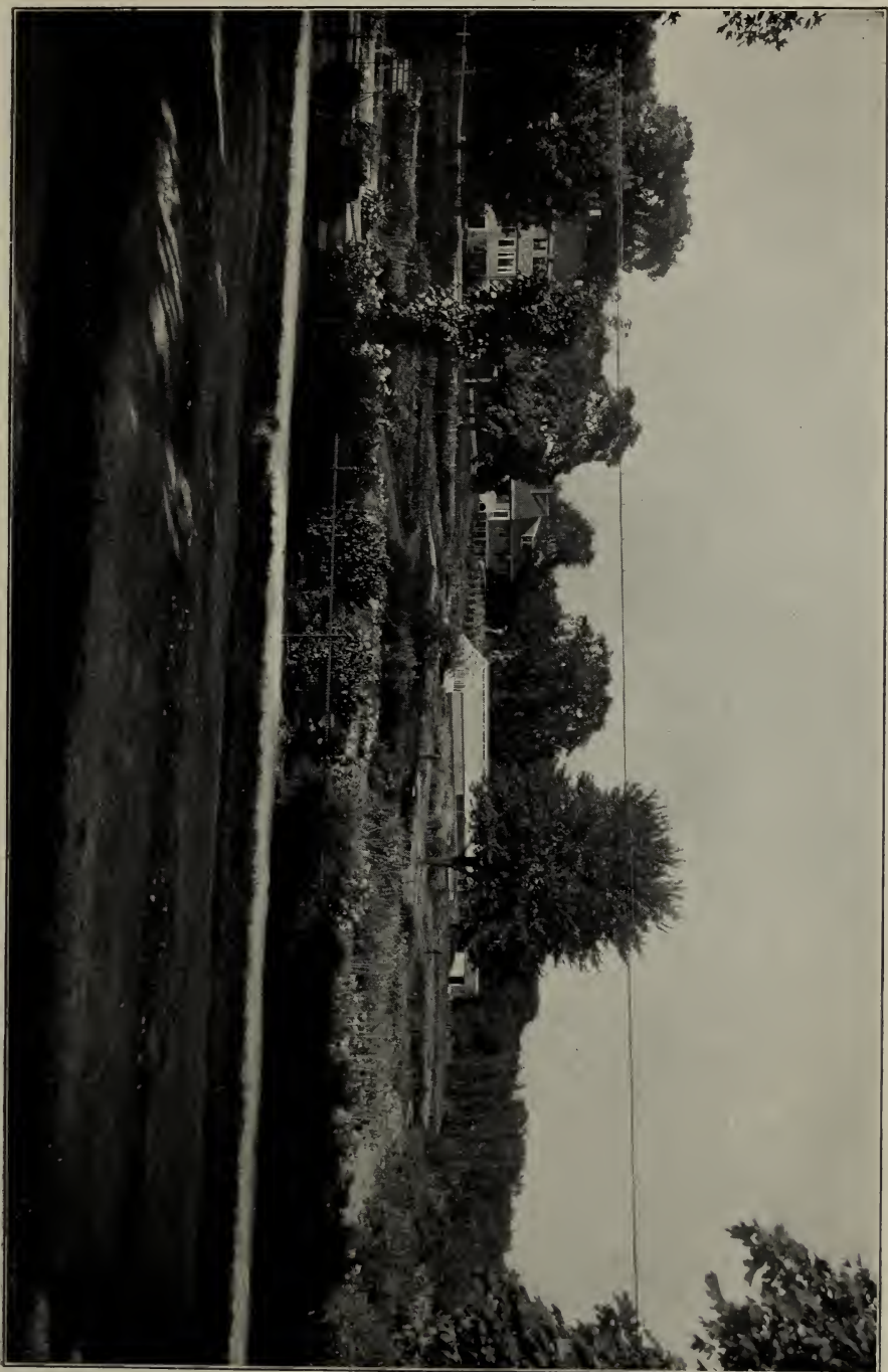
NATURAL SCIENCE GARDEN