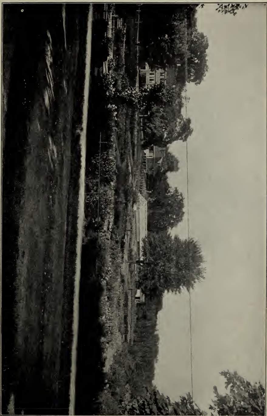
NATURAL SCIENCE GARDEN