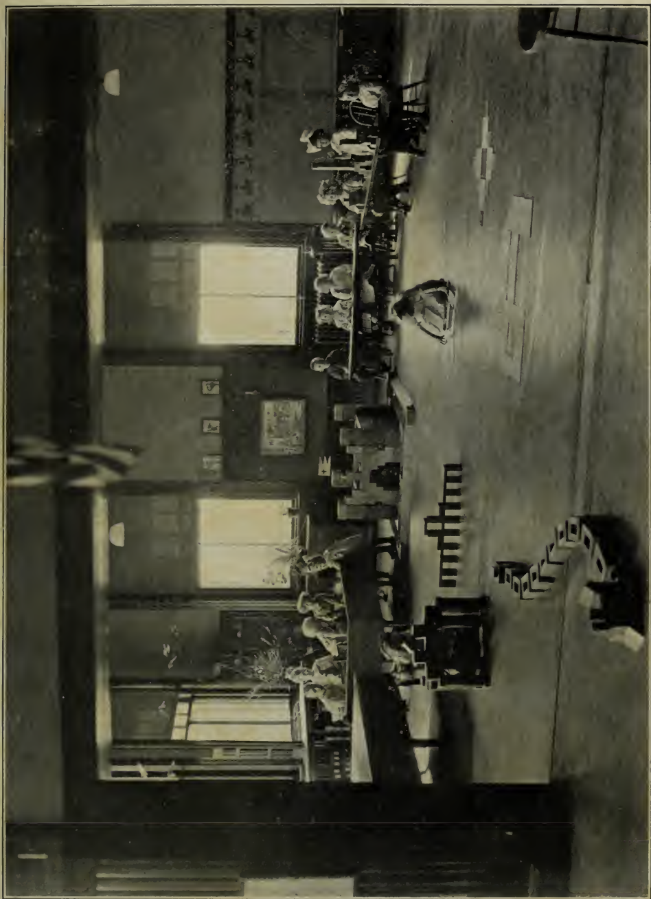
CONSTRUCTIVE WORK — KINDERGARTEN