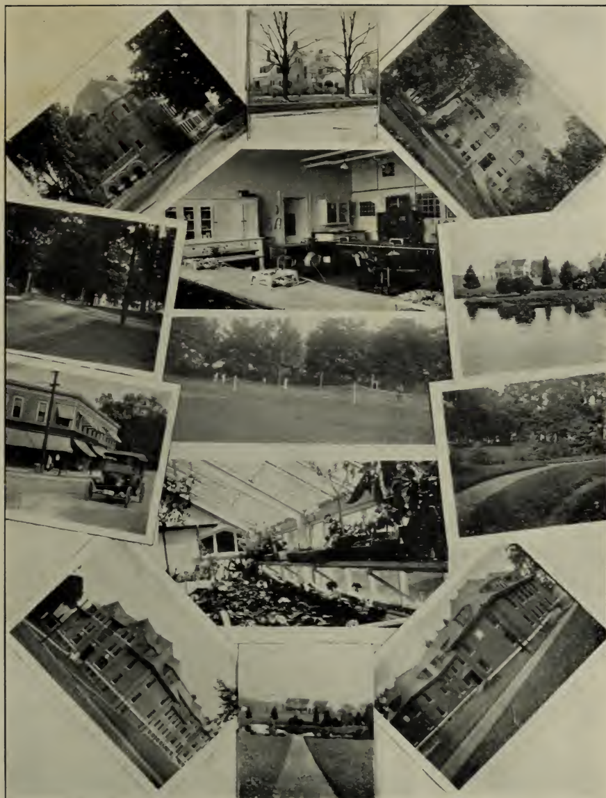
FAMILIAR SCENES AROUND NORMAL SCHOOL.