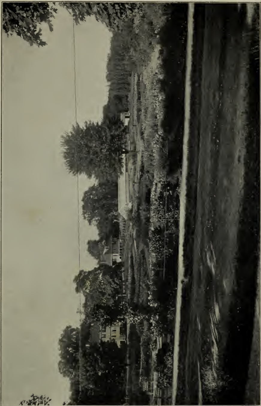
NATURAL SCIENCE GARDEN