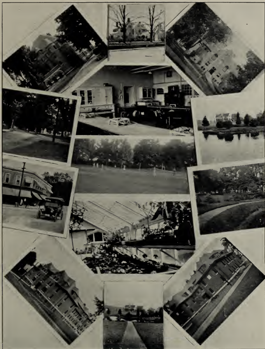
FAMILIAR SCENES AROUND NORMAL SCHOOL.