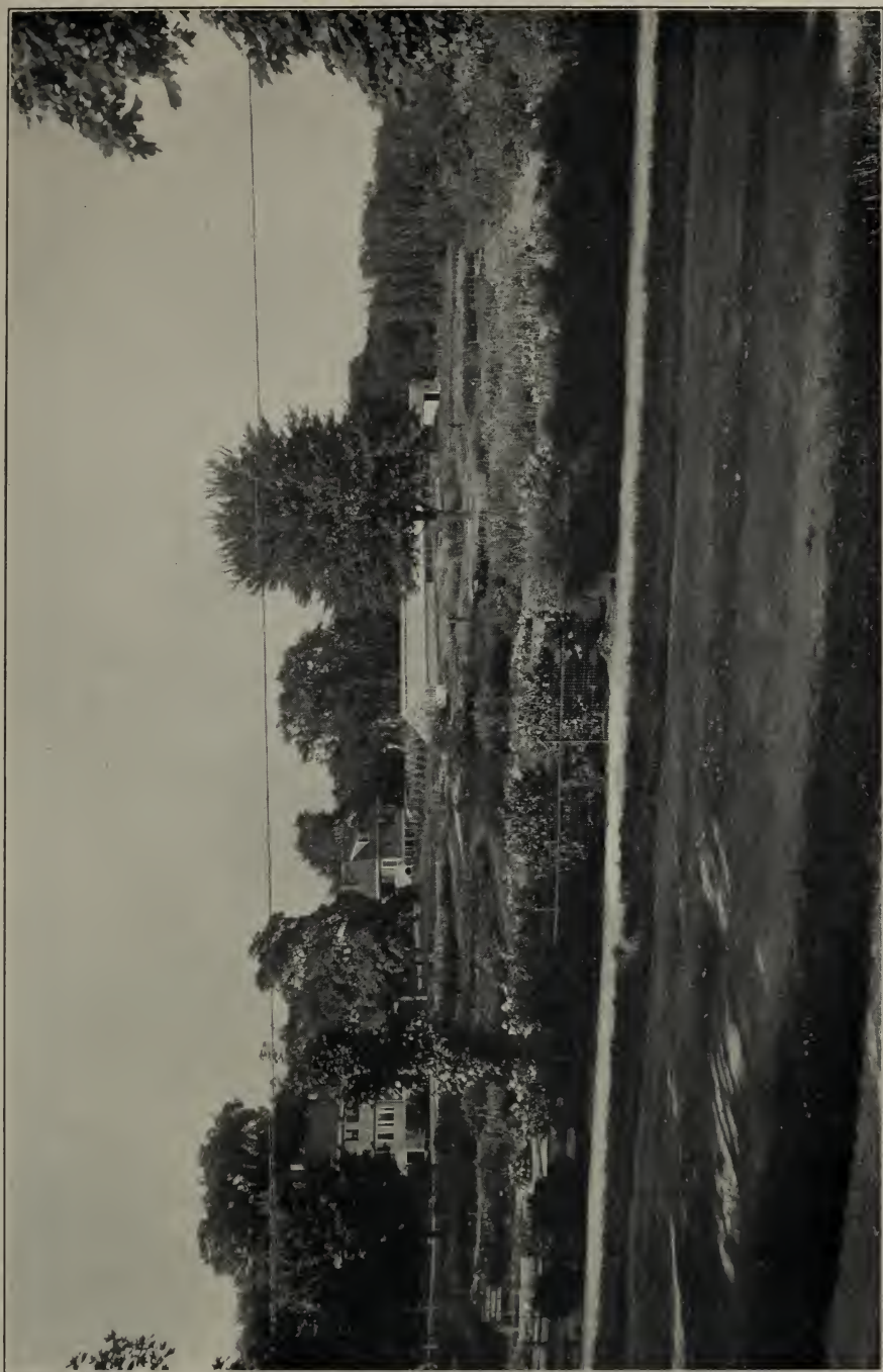
NATURAL SCIENCE GARDEN.