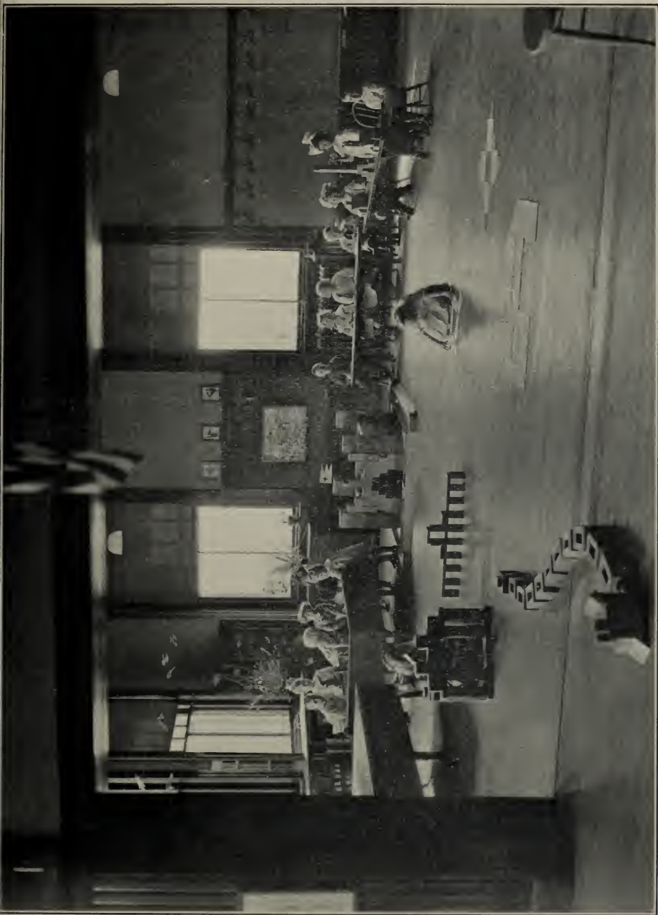
CONSTRUCTIVE WORK — KINDERGARTEN.