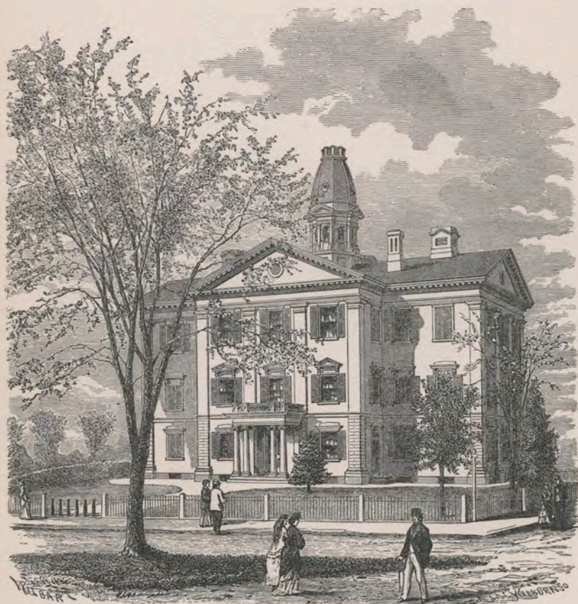
STATE NORMAL SCHOOL, BRIDGEWATER, MASS.