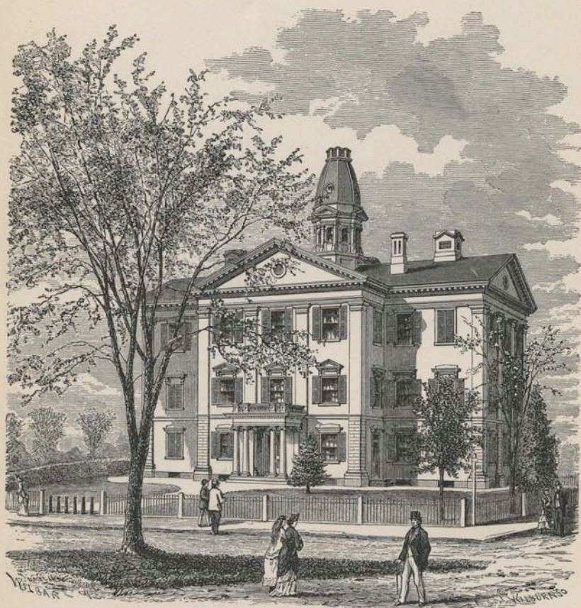
STATE NORMAL SCHOOL, BRIDGEWATER, MASS.