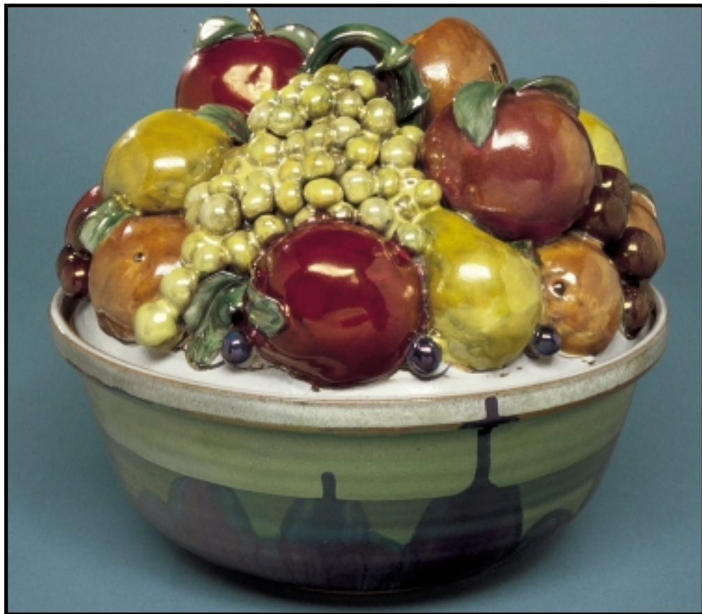
Ceramic Bowl of Fruit