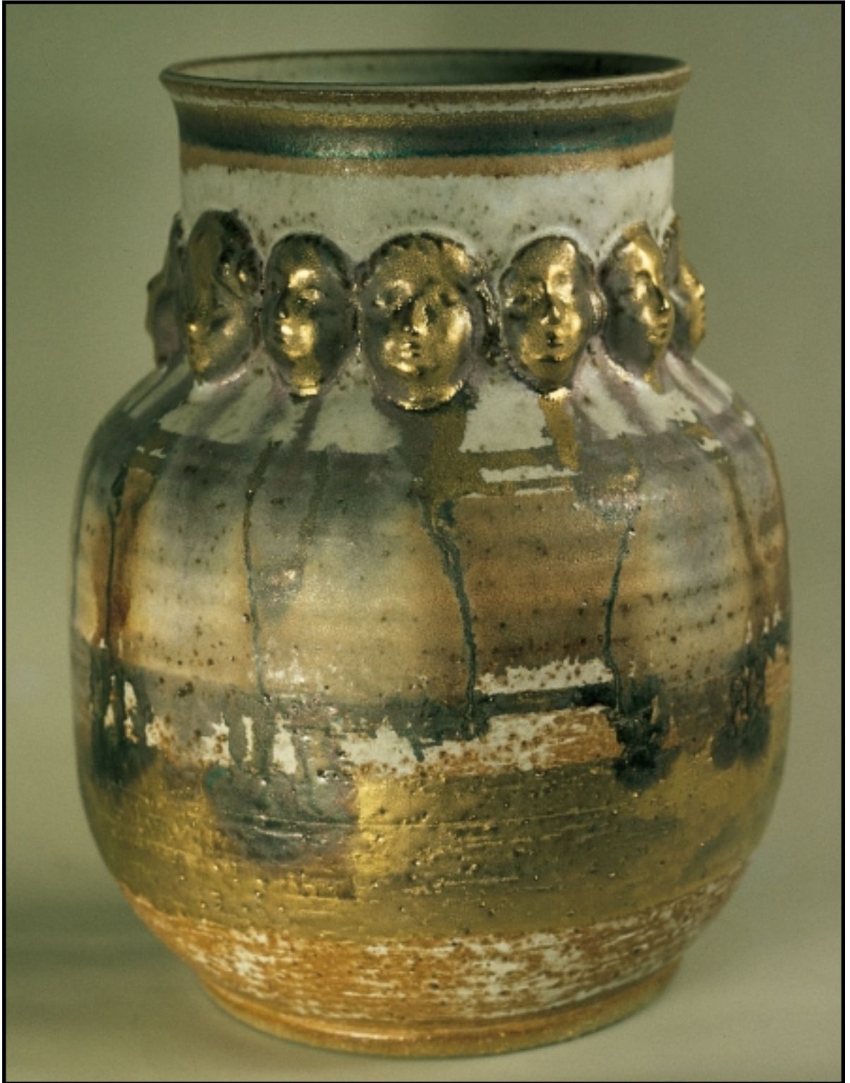
Ceramic Jar with Faces