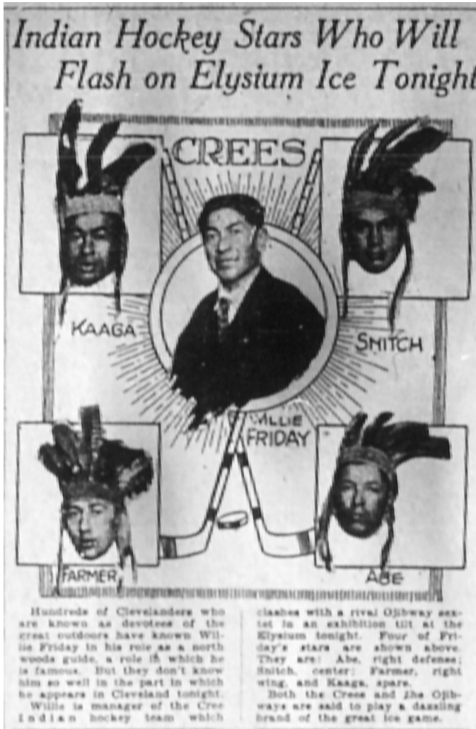
Figure 3 — Coverage in the Cleveland Press ( Cleveland Plain Dealer , 28 January 1928).

Not all newspapermen were so lazy or gullible that they were willing to rubber stamp the Wild West narrative without at least a raised eyebrow, or a note of discomfort. It was important that some of these writers let their readers know