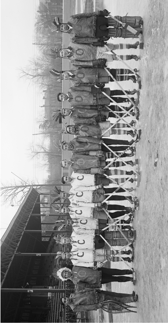
Figure 2 — Cree and Ojibway Indian Hockey Tour, Toronto, 11 January 1928. (Credit: Alfred Pearson, Commercial Department, City of Toronto, Courtesy of City of Toronto Archives).