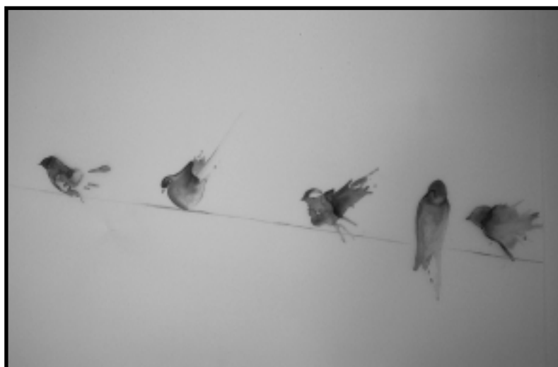
Right, Heralds of Spring 32" x 40"