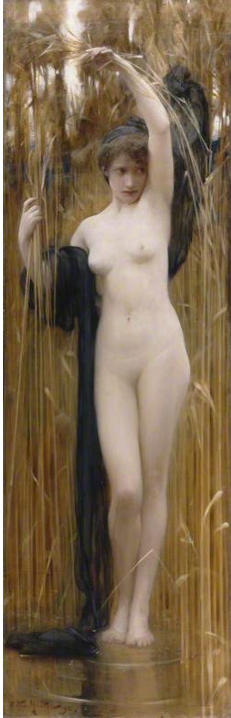
Figure 2. Syrinx (1892) Arthur Hacker Manchester Art Gallery BY – NC - ND

Although this scene is extracted from a chase narrative, Syrinx is standing feet firmly together not running. The delicate, shallow ripples on the water at her feet emphasise her stillness; she is standing, illuminated body on display, to be viewed. Instead of contradicting the nymphomaniac, these nymphs are important in constructing a paradigm in which passivity and powerlessness can be part of a woman's "excessive" sexuality.