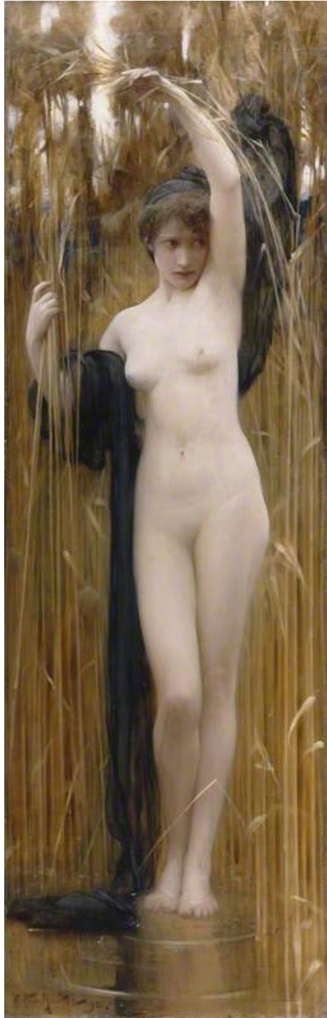
Figure 2. Syrinx (1892) Arthur Hacker Manchester Art Gallery BY – NC - ND

Although this scene is extracted from a chase narrative, Syrinx is standing feet firmly together not running. The delicate, shallow ripples on the water at her feet emphasise her stillness; she is standing, illuminated body on display, to be viewed. Instead of contradicting the nymphomaniac, these nymphs are important in constructing a paradigm in which passivity and powerlessness can be part of a woman's "excessive" sexuality.