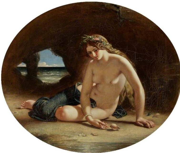
Figure 4. 'The Sea Cave' (c.1851) William Edward Frost Russell-Cotes Art Gallery & Museum BY – NC - ND

In the 1850s, after the death of William Etty, pioneer of the British female nude, there was a scarcity of female nude paintings. 20 Etty's successor William Frost produced cabinet-size paintings of generic, anonymous nymphs with languid bodies and free-flowing hair. The paintings were titled Wood Nymph (c. 1850) [Fig. 3], and The Sea Cave (c. 1851) [Fig. 4], expressing the nymph's identity purely through her relation to her home environment; she is part of the landscape. In Frost's The Sea Cave , the unnamed sea nymph lounges on the sand inside a cave. Her back and arms are bent and arched, repeating the curves of the cave's opening. Her body is a reinterpretation of her home environment. The position of lounging or reclining on the ground, whether on the shore or on the forest bed, is a typical nymph pose and creates an image in which the nymph's naked body makes a parallel line to the ground, as if she is another layer in the backdrop, conveying her deep connection to the natural world.