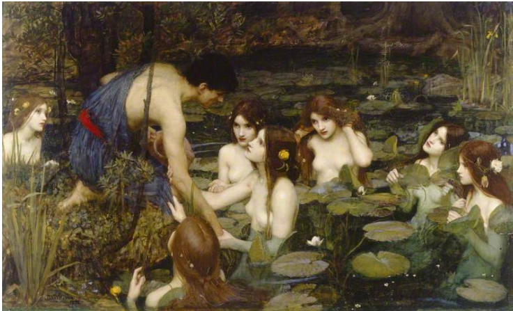
Figure 1. Hylas and the Nymphs (1896) John William Waterhouse Manchester Art Gallery BY-NC-ND

object of their assault is Hylas; they attack a single human man as a group. Their functioning as a group is particularly noticeable in Waterhouse's Hylas and the Nymphs (1896) [Fig. 1], in which the seven nymphs were drawn from two models (Goldhill 2011). The nymphs are beautiful and unnervingly similar as they gaze at Hylas with desire. They provide the sexual threat of an amorphous mass of women, whose bodies and faces blur into one another, as if they are multiplying before the viewer's eyes.