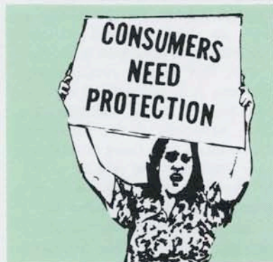
The Consumer Movement