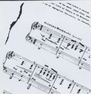
Louis Moreau Gottschalk