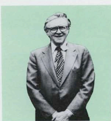
Rediscovering James T. Farrell