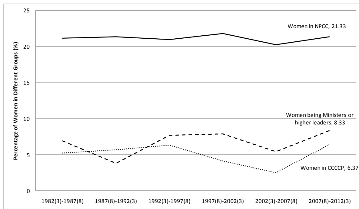
Figure 1: Proportion of Women at Top Levels of Chinese Power Structures [from 1982(3) to 2012(3)]

Data sources: Women in NPCC: http://cpc.people.com.cn/GB/64162/64168/index.html ; Women being Ministers or higher leaders: http://www.china.com.cn ; http://www.people.com.cn/zgrdxw/zlk/main.html ; http://www.npc.gov.cn ; Women in CCCPC: http://lianghui.china.com.cn/08ch-meet/ziliao/index.html